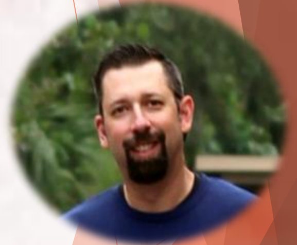
9 th Grade Discipline