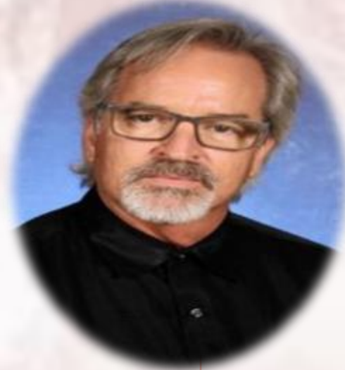
10 th Grade Discipline