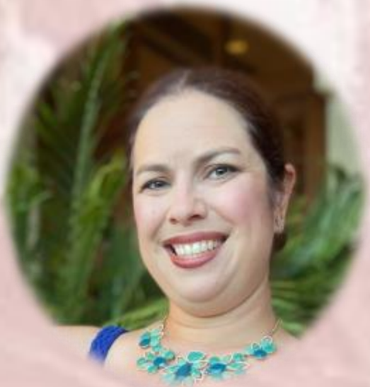
12 th Grade Discipline