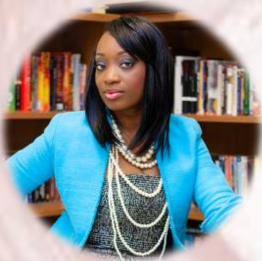
11 th Grade Discipline